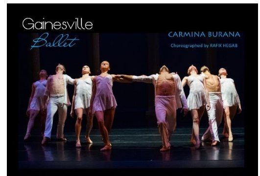
Carmina Burana