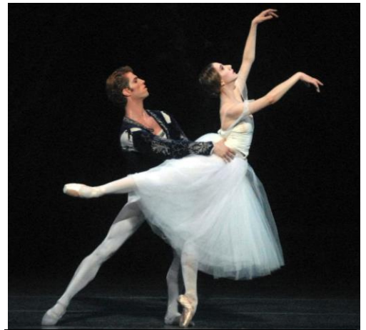
James Whiteside and Isabella Boylston in Giselle.